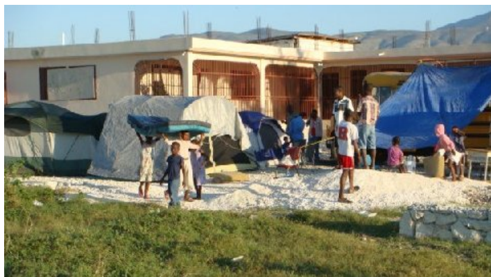
Setting up Camp

Here are some photos that I just received of our 28 kids at My Father's House Orphanage.