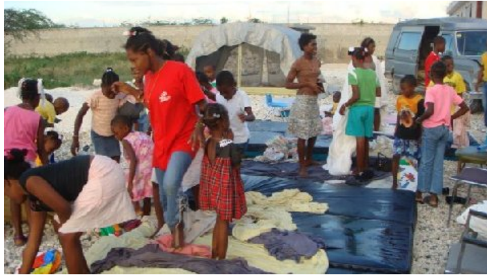
The Broken Security Wall around the Orphanage